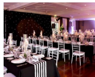
GALA & AWARD DINNERS